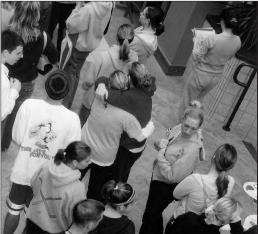
Elizabethtown College students form friendships that last a lifetime.